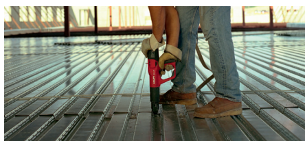
Fastening temporary deck to steel