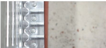
Fastening deflection clips to steel