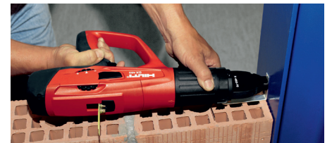
Fastening wall-ties to steel