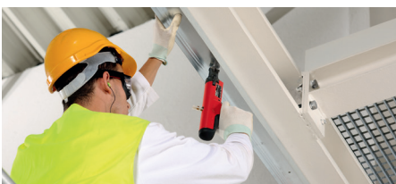
Fastening drywall track to steel