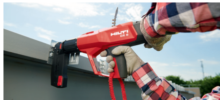
Fastening deflection clips to steel